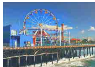
Santa Monica Pier

Pasadena City College Flea Market https://pasadena.edu/community/flea-market/ Not as large as the Rose Bowl Flea Market, but still a lot of fun.