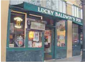
Lucky Baldwin's Pub

El Metate $ 12 N Mentor Ave., Pasadena (626) 229-0706 Authentic Mexican food in a casual setting. Fantastic tostadas.