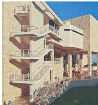
The Getty Museum

The Arboretum http://www.arboretum.org Peaceful, expansive gardens with lots of peacocks.