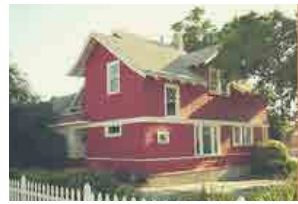
The Best Little Cat House

VCA Mission Animal Hospital 25 W. Mission Road, Alhambra Nice staff, clean environment.