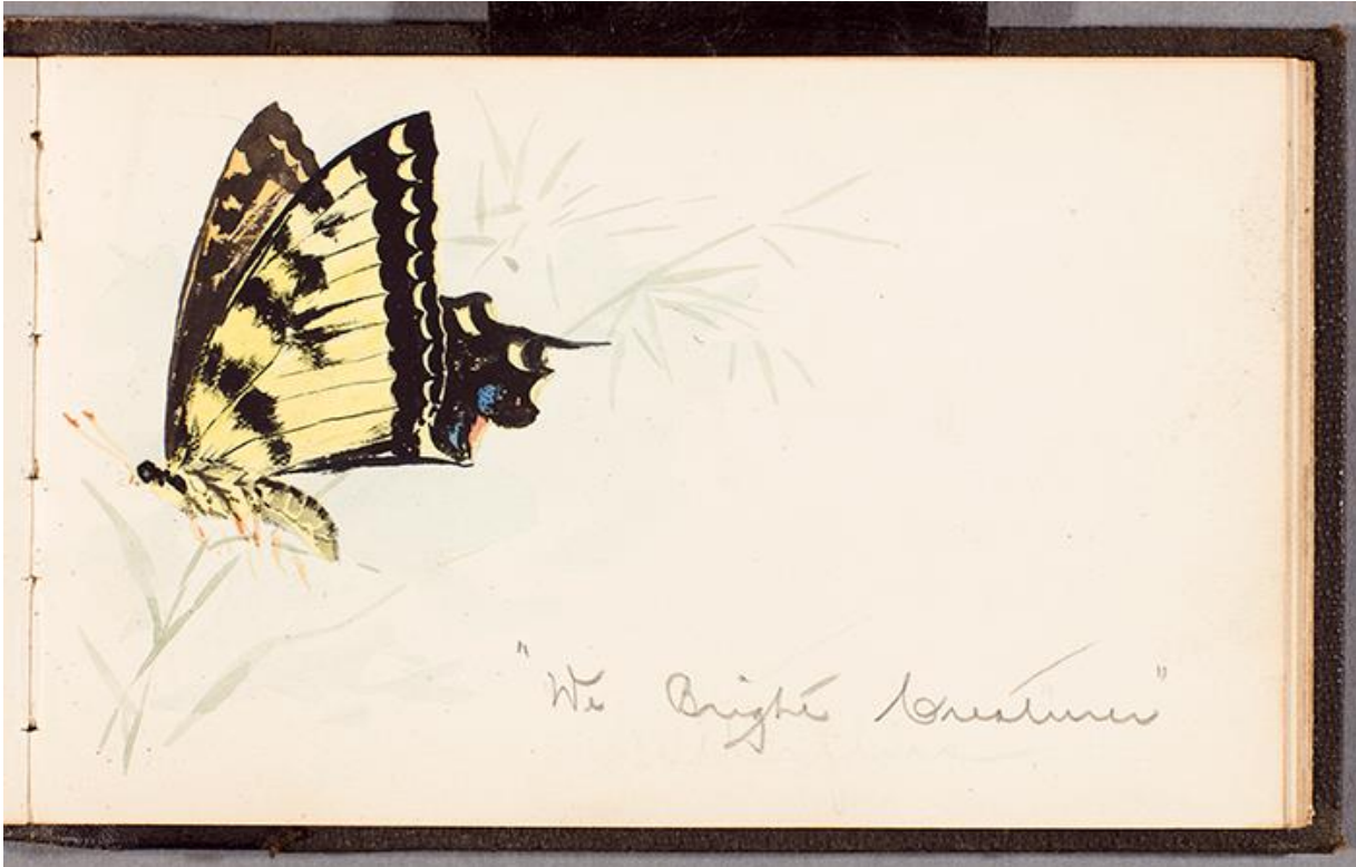
The Huntington Library, Art Museum, and Botanical Gardens.

Olive Percival made drawings of buildings, such as this miner's camp. She also made sketches of the wildlife she encountered including this beautiful image of a colorful butterfly: