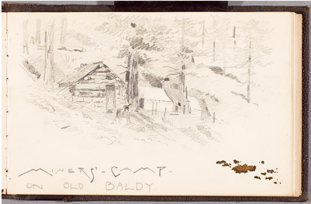
The Huntington Library, Art Museum, and Botanical Gardens.