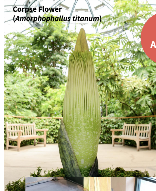
Corpse Flower ( Amorphophallus titanum )

The Rose Hills Foundation Conservatory for Botanical Science