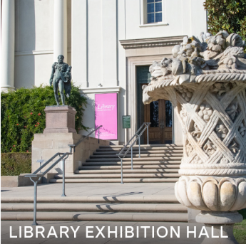
LIBRARY EXHIBITION HALL

THE LIBRARY is one of the world's great independent research libraries with some 12 million items, including rare books, manuscripts, prints, maps, and photographs from the 11th century to the present. Highlights from the collections are on view in the Library Exhibition Hall until spring 2025. Starting in summer 2025, select collection items will be on view in the Huntington Art Gallery.