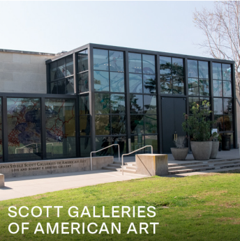
SCOTT GALLERIES OF AMERICAN ART