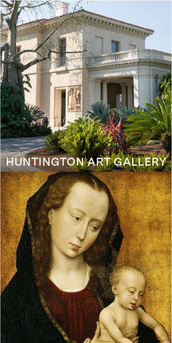
HUNTINGTON ART GALLERY