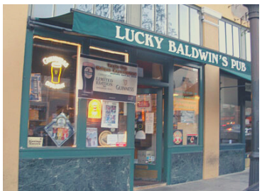
Lucky Baldwin's Pub