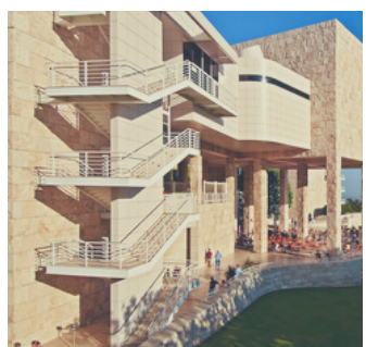
The Getty Museum