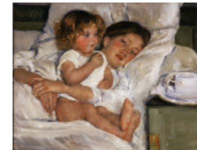
Breakfast in Bed , 1897, by Mary Cassatt

The Huntington Art Gallery, completed in 1911, originally was the Huntingtons' residence. The gallery displays one of the finest collections of European art in the nation, as well as providing a sense of the Huntingtons' lifestyle. Highlights of the 18th-century British and French art include Gainsborough's Blue Boy , Lawrence's Pinkie , and Jean-Antoine Houdon's bronze Diana the Huntress . The gallery comprises 55,000 square feet, displaying approximately 1,200 objects, from 15th-century Netherlandish and Italian works to British "Grand Manner" portraiture to objects from the 19th-century British Design Reform movement.