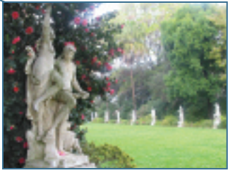
Sculpture on the North Vista lawn