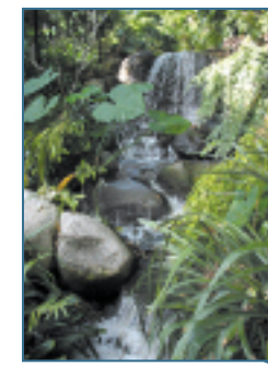
Jungle Garden waterfall