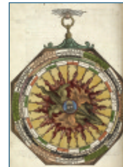
Astronomicum caesareum, 1540, by Petrus Apianus