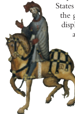
Detail from Ellesmere Manuscript of Geoffrey Chaucer's The Canterbury Tales , ca. 1410.

The Library's collection of rare books and manuscripts in the fields of British and American history and literature is nothing short of extraordinary. For qualified scholars, The Huntington is one of the largest and most complete research libraries in the United States in its fields of specialization. For the general public, the Library has on display some of the finest rare books and manuscripts of Anglo-American civilization. Altogether, there are about 6 million items.