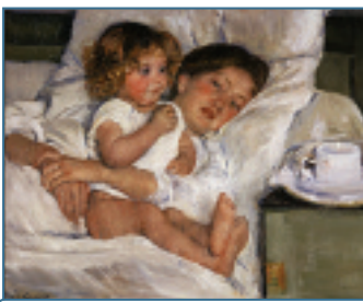
Breakfast in Bed by Mary Cassatt, 1897