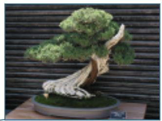
California Juniper in the Bonsai Court