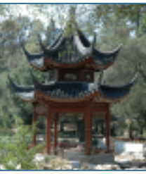
Pavilion of the Three Friends