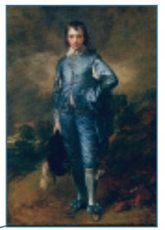
The Blue Boy by Thomas Gainsborough, ca. 1770