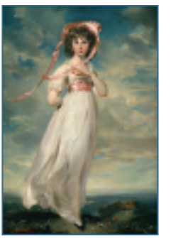
Pinkie by Sir Thomas Lawrence, 1794