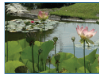
Summer blooming lotus flowers at the Lily Ponds