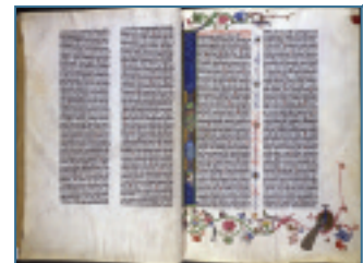
The Gutenberg Bible, 1455