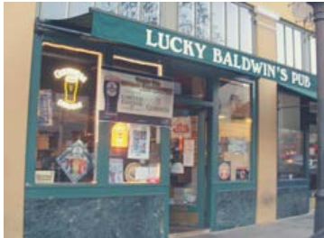
Lucky Baldwin's Pub

The Novel Café $$ 1713 E. Colorado Blvd., Pasadena (626) 683-3309 Breakfast, brunch, and modern American fare. Frequented by college students.