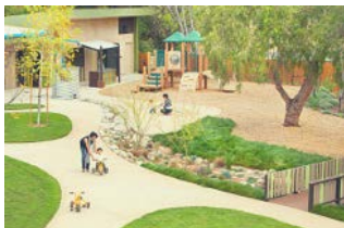
Children's Center at Caltech