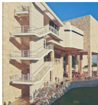
The Getty Museum

The Arboretum http://www.arboretum.org Peaceful, expansive gardens with lots of peacocks.