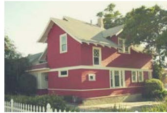
The Best Little Cat House

Crown City Veterinary 2657 E. Washington Blvd., Pasadena (626) 296-1001 Nice staff, clean environment.