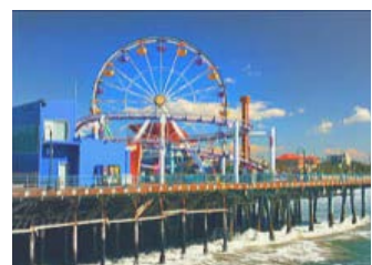
Santa Monica Pier

Catalina Island http://www.catalinachamber.com/ A short boat ride away.